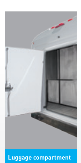
Rear luggage rack